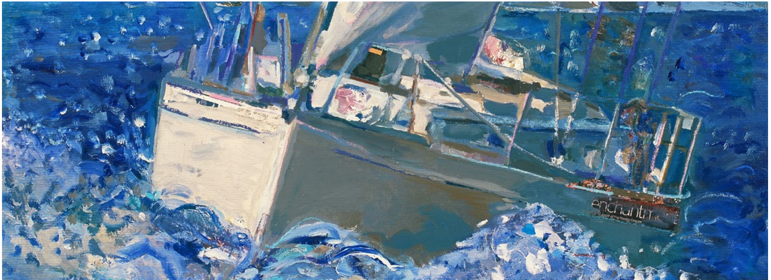
Painting courtesy José Antonio Valverde-Alcalde